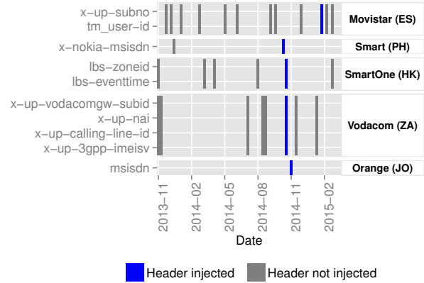
Figure 1: Privacy-sensitive HTTP Headers observed per MNO. We show sessions that indicate presence of the respective header in blue, while sessions from the same provider but without the particular header appear in gray.

Vodacom South Africa is the most egregious information leaker in our dataset, revealing the subscriber’s phone number, device IMEI, and an email-like string that contains their phone number ( subscriber_phone_number@