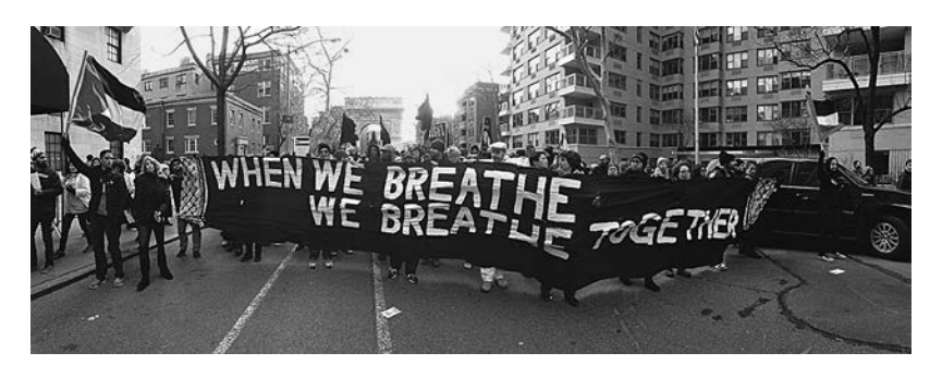
FIG. PREF.4. The Palestine contingent at the Millions March, New York City, December 2014. The ends of the banner display the pattern of the Palestinian keffiyeh. The Washington Square Arch is visible in the background. Reprinted with artist's permission.