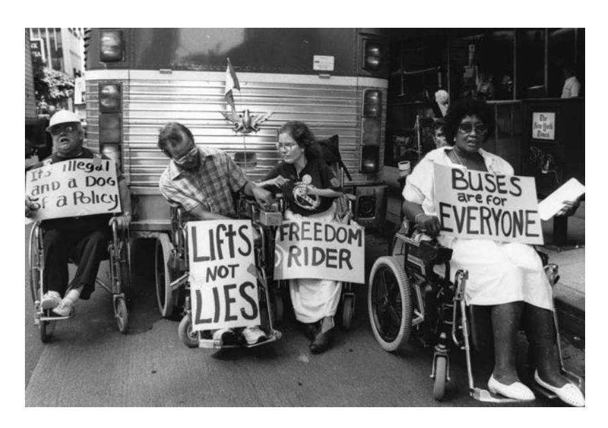
FIG. PREF.3. ADAPT activists demonstrating for accessible transportation in Atlanta, Georgia, October 1990.

Black Lives Matter and the LGBTQ rights movement as examples of this traction, she responds to her musings: "One answer is that we have a much clearer collective notion of what it means to be a woman or an African American, gay or transgender person than we do of what it means to be disabled." There is perhaps misrecognition of Black Lives Matter as a "pride" movement, not to mention that at an earlier moment in history, the disability rights movement often marked itself as both intertwined with and following in the path of the black civil rights movement. Analogies between disability and race, gender, and sexuality tend to obfuscate biopolitical realities, as Garland-Thomson's clunky list of identifications attests. Movements need to be intersectional, says Angela Davis, and the rapid uptake of this seasoned observation is invigorating and hopeful. This invocation of intersectional movements should not leave us intact with ally models but rather create new assemblages of accountability, conspiratorial lines of flight, and seams of affinity.