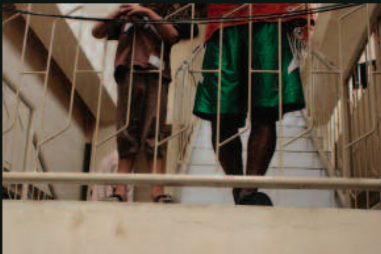
Two asylum-seeking boys stand on a staircase while detained at Belawan Immigration Detention Center in September 2012.

Human Rights Watch calls on Indonesia to create a legal environment that protects children by acceding to international treaties that protect refugees. It should stop detaining children without review, ban detention of unaccompanied children, and immediately reform the immigration detention system. Australia should support real reform of regional migration policies so that children and adults can find safe refuge.