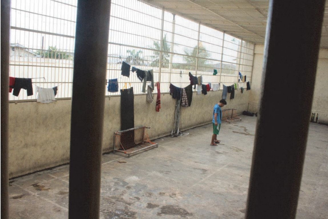
An Afghan asylum-seeker walks in the courtyard used for outdoor recreation time at Belawan Immigration Detention Center, September 2012. Some interviewees reported being held for months without access to recreation spaces.

According to our interviewees, access to recreation seemed to be at the whim of immigration staff. Faizullah A., also from Afghanistan, was 17 years old when he was detained for seven-and-a-half months at Pontianak IDC: