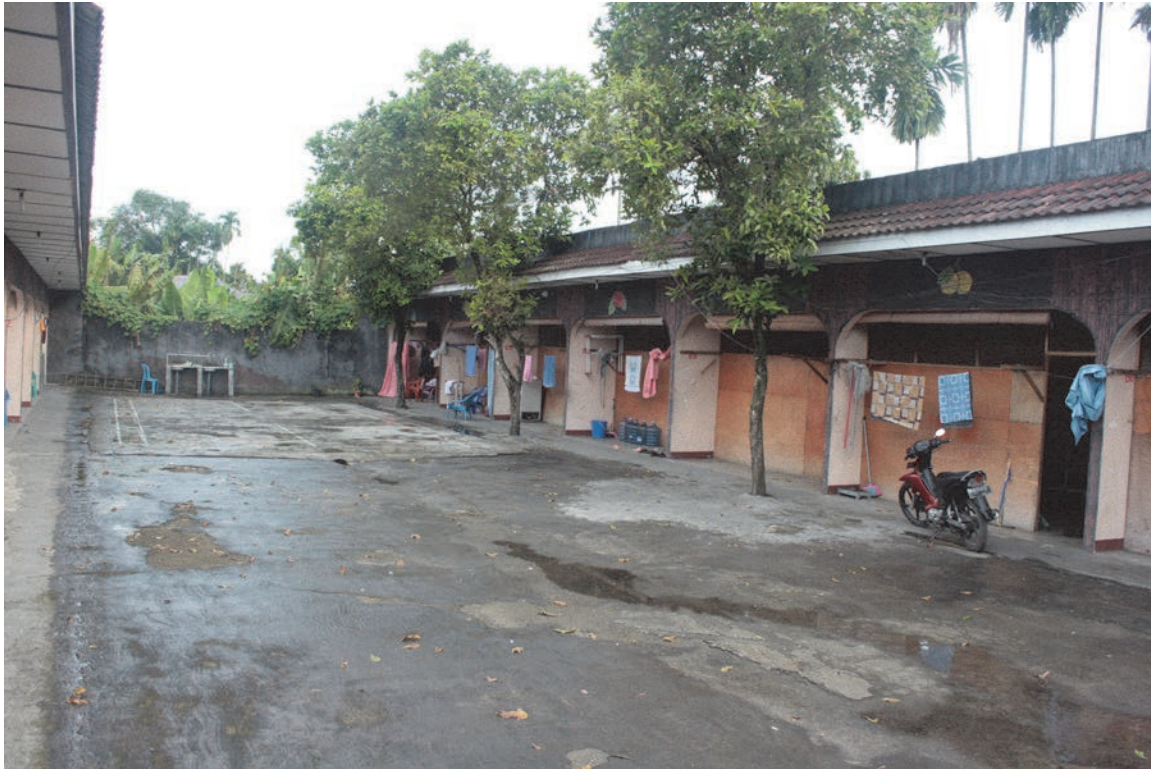
Living center for asylum seekers and refugees in Medan, northern Sumatra. Even once released from detention, asylum seekers and refugees must live in certain areas and cannot move freely about the country. Families living here reported flooding, overflowing sewage, and concerns about neighborhood crime.