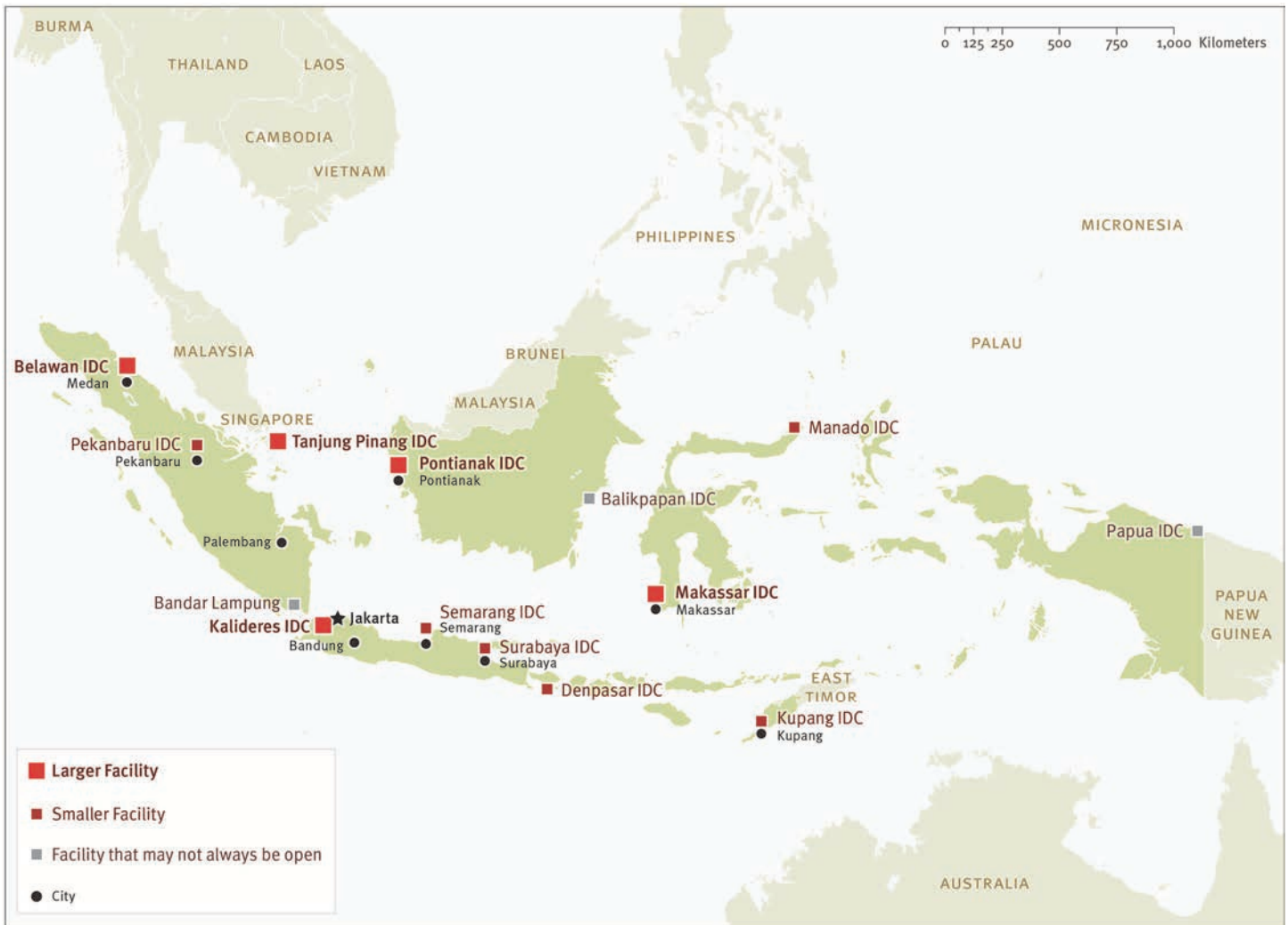
Indonesian immigration detention centers.

Migrants interviewed by Human Rights Watch, including children, reported being held in a number of alternate facilities in addition to the IDCs. Regional immigration offices, including those in Medan, Denpasar, Padang, and Jakarta, have holding rooms or cells, which typically are used to hold migrants for short periods of time (our interviewees who were held in these facilities referred to periods of time less than one month). In addition, Indonesian authorities use hotels or other buildings, with guards (sometimes from the Directorate General of Immigration, and sometimes from the police), to hold groups of migrants for short periods. The total number of informal facilities used to detain migrants is hard to know, as different facilities are open at different times.