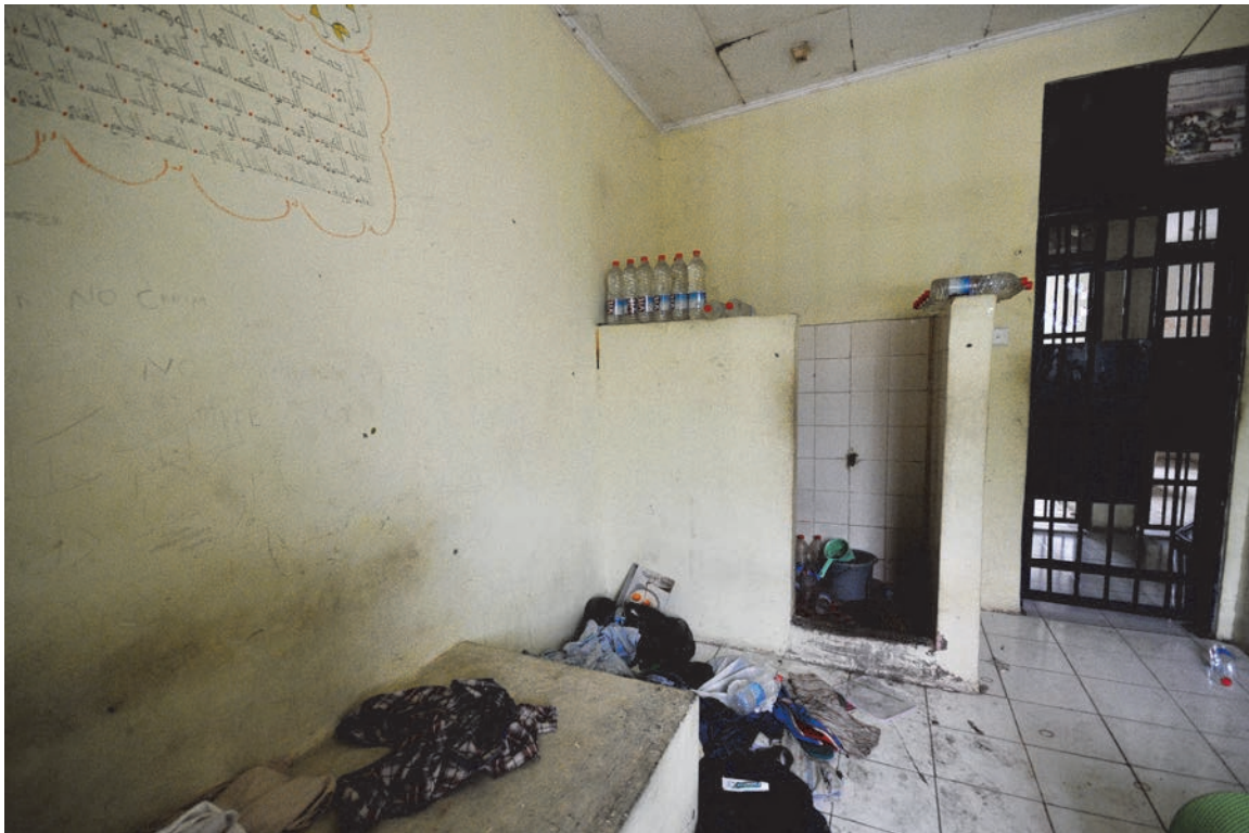
A cell at Kalideres Immigration Detention Center near Jakarta. Detainees reported that living areas were unsanitary and that they frequently lacked adequate water, bedding, and mattresses.

Migrants reported poor sanitation facilities and insufficient amounts of water for drinking and bathing in a variety of detention facilities. A girl age 17 interviewed at Belawan IDC reported, “It’s difficult for girls to have a bath. There is no privacy. Our window got broken in the bathroom so we have to cover it with some cloth to have privacy now.” 203