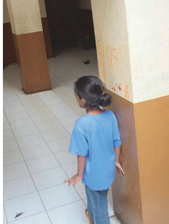
An asylum-seeking girl, thought to be from Sri Lanka, walks through Belawan Immigration Detention Center while detained with her family, September 2012.