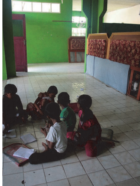
Rohingya children seeking asylum with their families attend an English class sponsored by the International Organization for Migration at a living center for asylum seekers in Medan, September 2012.

Though many children do not have access to formal education, IOM in collaboration with some local NGOs provide some informal education, including English classes, for refugees and asylum seekers who fall under IOM care. 259 Yet IOM’s programs are not sufficient to replace formal education programs. Under international law, a child’s nationality cannot